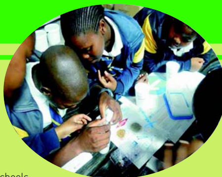
South African pupils measuring the pH of water during the Big Splash in Cape Town in March