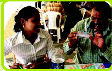
Teachers on Rodrigues Island in Mauritius using a microscience kit to oxidate ferrous sulphate at a workshop in August 2008

Given their multiple advantages, it was not long before the miniature kits caught on. Cameroon, Tanzania and South Africa have invested massively in them, as have Russia and the U.K., Angola, Ethiopia, Namibia, Malaysia, Sudan, the Gambia and the Palestinian Authority have all held workshops to adapt the kits to the national curriculum, while other countries are still at the stage of demonstration workshops. Today, there is a growing demand for UNESCO's assistance in customising the miniature kits for national use — and nowhere more so than in Africa.