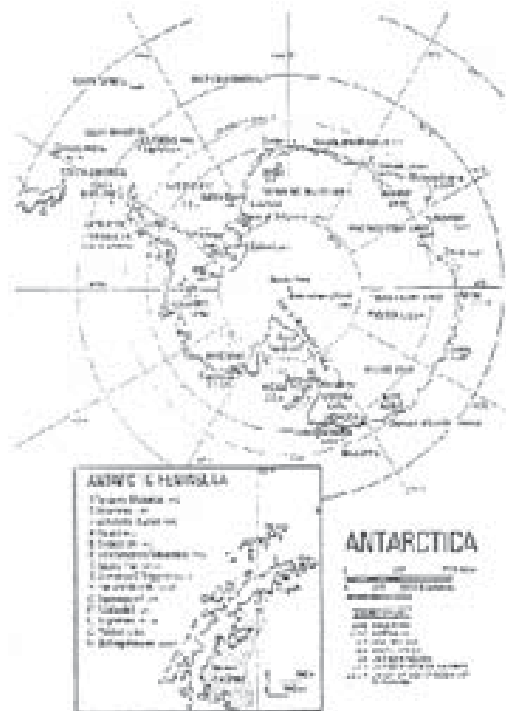
Fig. 2: Map of Antarctica and South Pole

temperature minus 88.3°C has been recorded in Antarctica and violent snowstorms with winds of over 250 km per hour speed are very frequent in this icy desert. It is the coldest and the windiest continent.