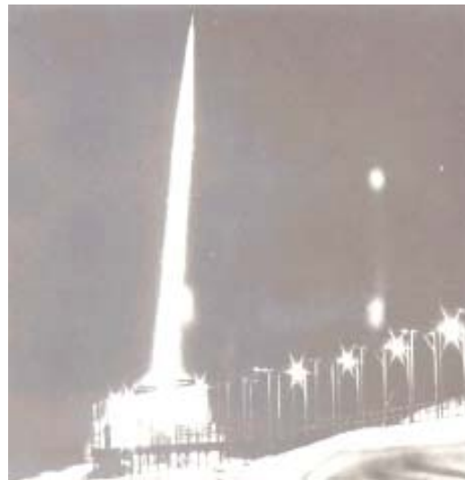
Fig. 5: 'M-100' rocket at take-off from the launching-pad near 'Molodezhnaya' Antarctic station during the extremely cold, dark and stormy 6-month long South Polar night

Leningradskaya, Bellingshausen, Novolazarevskaya, Amery and Molodezhnaya and relieved the old staff with the new expedition members. We sailed all along the Antarctic Circle and chose the site of a new Soviet station 'Russkaya' on the shore of the Amundsen sea. We took fuel and fresh food provisions for our ships and for the Antarctic stations from the port of Punta Arenas, Chile. But, unfortunately, the station Molodezhnaya could not be given sufficient food supply due to which we had to face a number of problems there. I visited several other stations operated by the Antarctic Treaty member-nations in order to collect maximum possible scientific data.