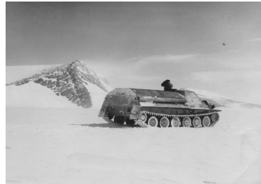
Fig. 7: A heavy 'towmobile' machine, a sort of snow-tank which is the latest mode of transportation in Antarctica

wintering in Antarctica. Comrade Evanov developed appendicitis trouble and had to be operated. Two of our expedition members became mentally ill due to long isolation and had to be closed indoors. During the winter, we encountered several violent blizzards with speeds exceeding 200 km per hour. Some of our houses were blown off along with the inmates and our unfortunate comrades died for the cause of science.