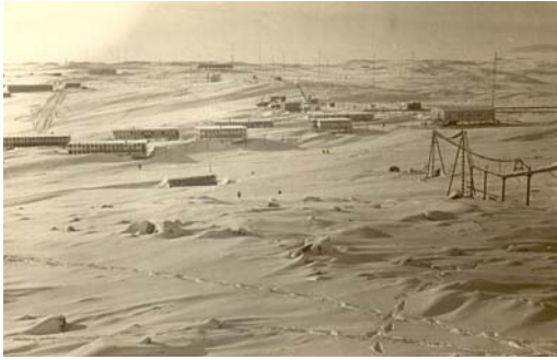
Fig. 4: A view of the Soviet Antarctic station 'Molodezhnaya'. During the extremely cold, dark and stormy 6-month long night, some of the huts were blown off along with the inmates. Winters are harsh and there is plenty of snow accumulation due to violent snow-storms. Some huts are built underground wherein sound does not reach, nor does light filter through.

followed by a 12 hour night were, indeed a great blessing!