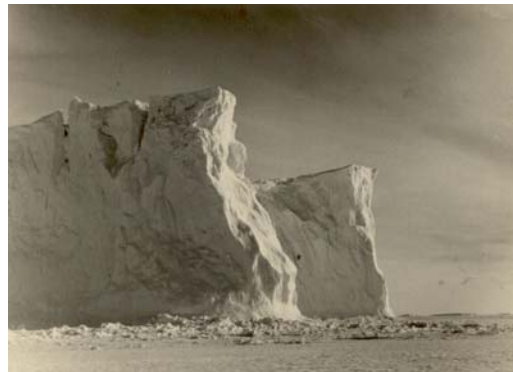
Fig. 1: Icebergs floating in the frozen Antarctic Ocean

*Reproduced with permission from "Indian Mountaineer", Vol. 2, 1978