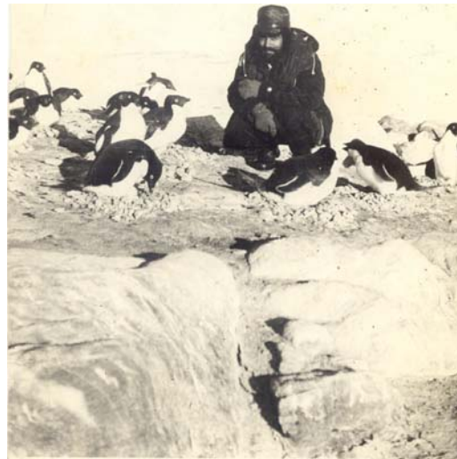
Fig. 9: The author in the company of penguins. The penguins are very curious and social birds and frequently come close to camps, ships and groups of men to watch what is going on. They usually walk erect and waddle along looking like a cartoonist's version of man returning from a formal dinner