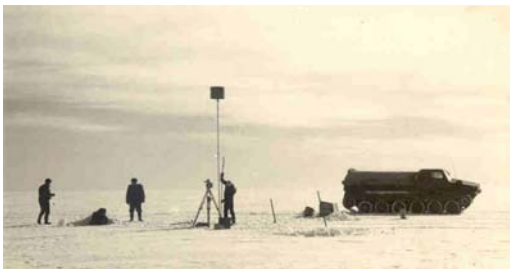
Fig. 3: Glaciological and Geodetic observations being made on way to Vostok. The author participated in the 1,500 Km sledge odyssey from Mirny to Vostok, the pole of cold, completed in one and a half months

sun begins its ascent marking Midwinter Day. As at all stations this turning point of the winter was celebrated with gusto. With the day marked by holiday routine, practically every one of us slept late. The only exception was our cook, who was busy preparing a lavish meal for that evening.