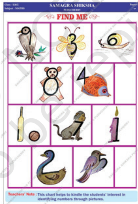
Figure 3: A poster elaborating teachers’ role in facilitating the achievement of learning outcomes

It is, thus, hoped that these innovative posters would engage students, especially, at the primary stage, in active learning, and boost their creativity, which would further better their scholastic and non-scholastic performance.