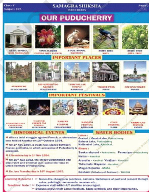
Figure 2: A poster emphasising the significance of the area

Posters have been provided for each class in all primary government schools of Puducherry, ensuring a colourful, attractive and enriching learning environment. Each school has been provided with a complete set of 63 posters, titled ‘print rich material posters’. Some posters emphasise the significance of the area like ‘Our Puducherry’ (Figure 2).