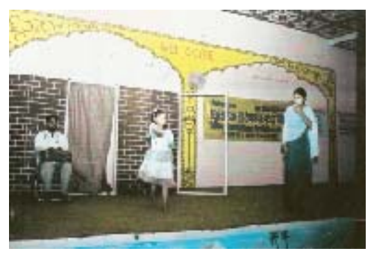
A play being enacted on female foeticide

The Primary Teacher: January and April 2008