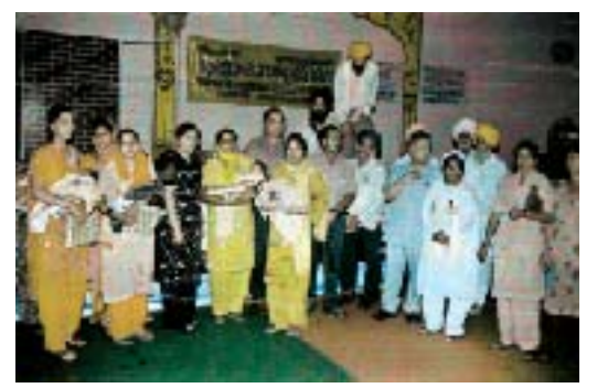
Young mothers with their newly born daughters and D.C, Civil Surgeon, functionaries. The names of all the new born girls in Navjot

As a result of continuous enforcement measures the sex ratio in 77 villages out of 475 in the district of new born babies had crossed 900. All those village panchayats were honoured on 8th March, 2006 on the International Women Day by Mrs. Anjali Bhawra, IAS, Commissioner, Patiala. Reports had been also published in almost all National dailies on the front pages. Out Look, a weekly magazine, carried a cover page story of district Nawanshahar in its issue of February 27, 2006.