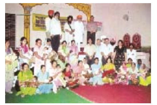
A function to celebrate the birth of baby girls in Ladhana Village.