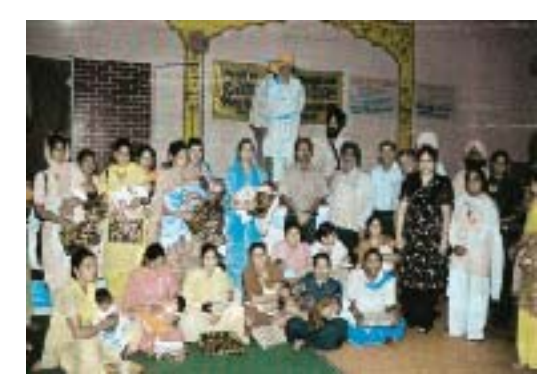
A function organised to honour the parents of new born baby girls